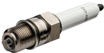
Bio-Gas Spark Plug