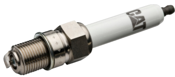
3500/3600 Spark Plug