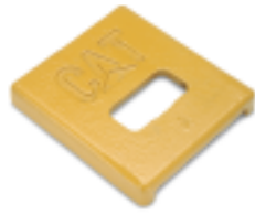
solid wear plate