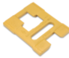
weld-on base plate