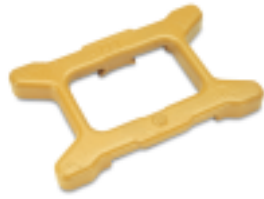
skeletal wear plate